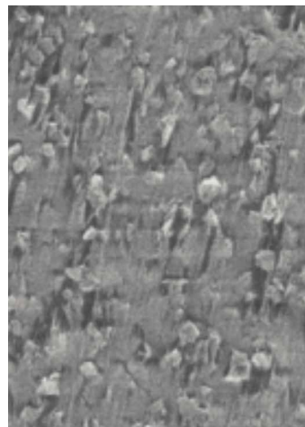
Electron microscopic view

Gasket sheet size of 60" x 60" in thickness of 0.02"/0.04"/0.06"/0.08"/0.12" or cut gaskets according to drawing, or EN and international Standards, special dimensions on request.